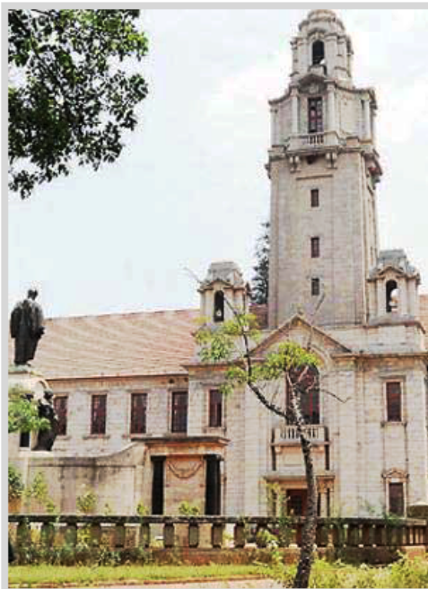
Indian Institute of Science is spread over 400 acres in the heart of Bangalore

By Sridhar Vivan, Bangalore Mirror Bureau | Feb 17, 2014, 01:00 AM IST